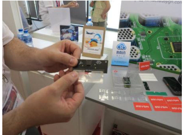
UHF RFID sensor, Asygn