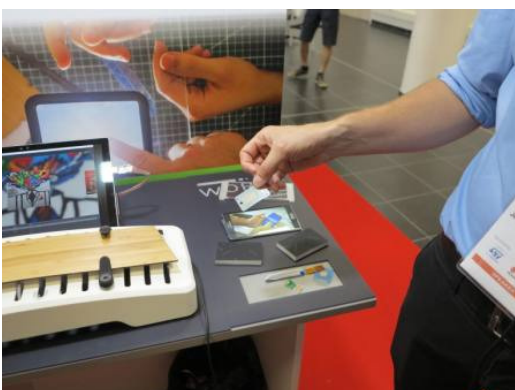
Piezo sensor WORMS