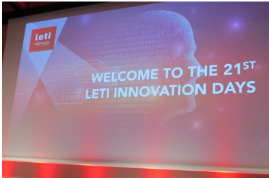
Leti Innovation Days June 2019